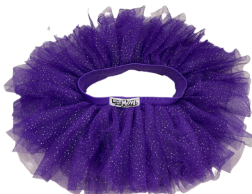
PURPLE TULLE SKIRT