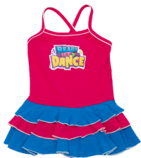
TUTU FRILL DRESS

All READY SET DANCE, READY SET BALLET & READY SET ACRO students will be required to wear the official uniform that we are sure you will love. Below are the following options that can be purchased.