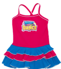
TUTU FRILL DRESS

All READY SET DANCE, READY SET BALLET & READY SET ACRO students will be required to wear the official uniform that we are sure you will love. Below are the following options that can be purchased.